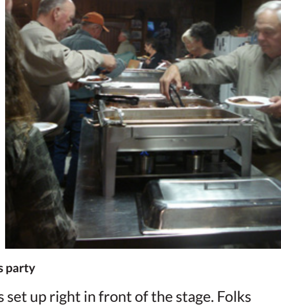
Scenes from the worker's party

The room was scattered with tables and a dance floor was set up right in front of the stage. Folks made good use of that dance floor as they let loose after four days of hard work in less than ideal weather. When dinner was served, people were presented with a buffet line of brisquette, sausage, baked beans, potato salad, and bread. This Wisconsin girl tried her very first brisquette (with some encouragement) and found it to be really good! Everything else was also delicious and a few people even went up for seconds.