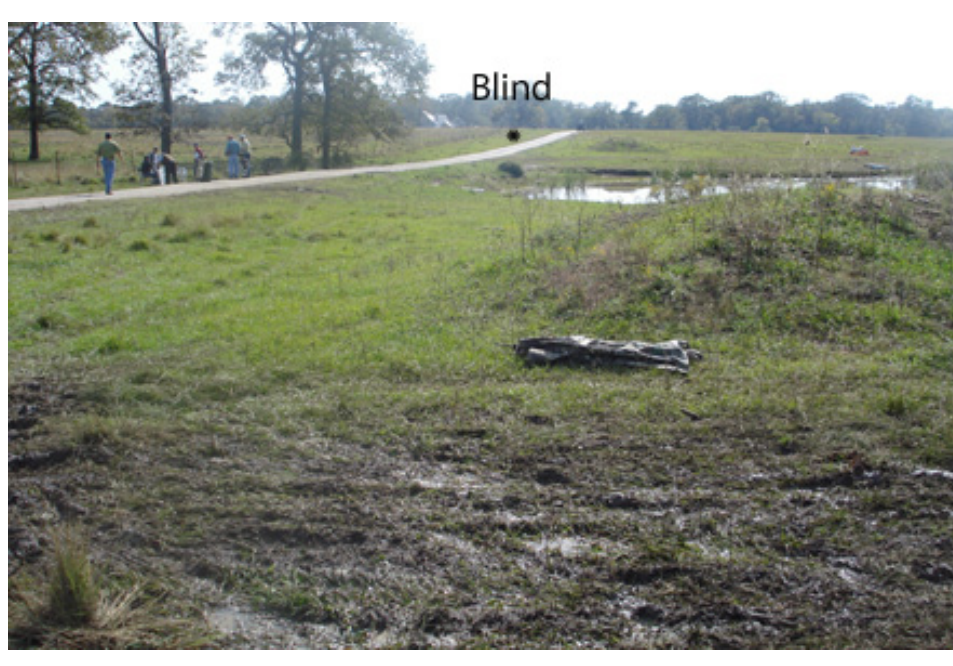
Test 7 - View from the line

The 7th Series is a Land Blind, with the line intersecting the paths to the Blind and the Mark from the combined 5th/6th Series. The line to the blind is over the bottom of a small hill, through a bit of water, then uphill and across the road. The bird being used is a drake mallard and it is planted 252 yards from the line. The blind planter is hidden behind a camouflage blind just behind where the blind is planted.