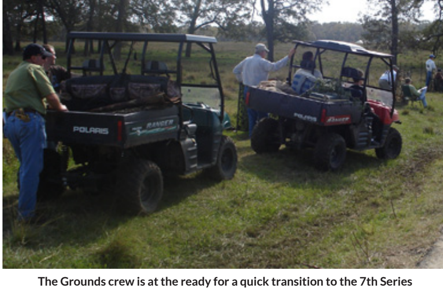
The Grounds crew is at the ready for a quick transition to the 7th Series

The transition to the 7th Series was very quick. The cars were not required to move, only the gallery was asked to move back about 30 yards.