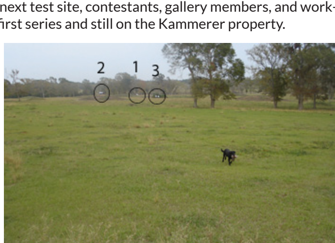
Test 8 - view from the line

The test is a land quad with 2 live rooster pheasants and 2 dead hen pheasants. The left-most gun station throws and shoots a live rooster pheasant flyer from right to left, landing 140 yards from the line. The left-middle gun station is perched atop a hill. They throw and shoot a live rooster pheasant flyer from right to left, landing 190 yards from the line. The right-middle gun station is situated on the bottom quarter of a hill. They shoot and throw a dead hen pheasant from left to right, landing 390 yards from the line. The right-most gun station is positioned in front of a large bush. The shoot and throw a dead hen pheasant from left to right, landing 240 yards from the line.