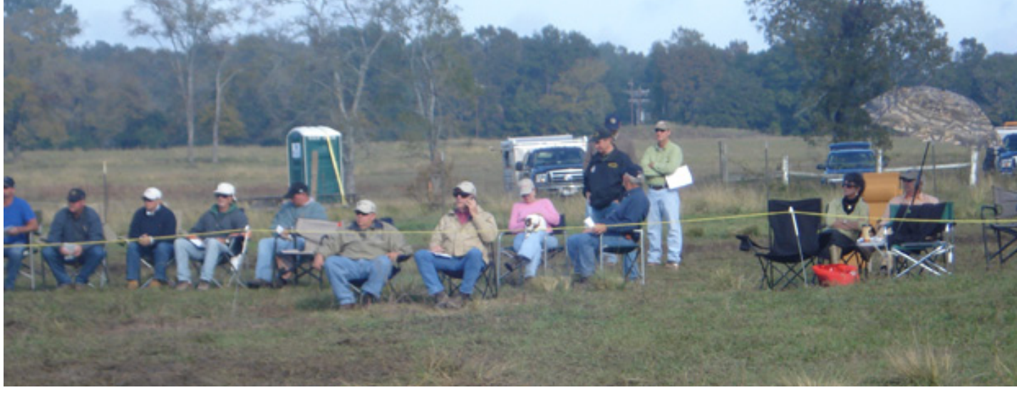
The gallery watches the 5th series

Temperatures this morning are once again very comfortable. There is a touch of humidity in the air and the clouds are just now starting to roll in. Temps should reach in the low 70s and there is only a predicted 20% chance of rain.