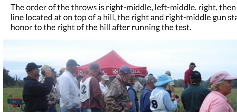
Handlers watch the 8th Series test dogs

The line located at on top of a hill, the right and right-middle gun stations retire. The team must then honor to the right of the hill after running the test.